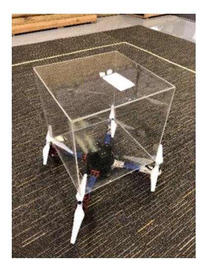
Figure 2. Prototype UAV with an acrylic cube box (a module)

To test-and-evaluate the UAV-module, the off-the-shelf component Q450 V4 glass fiber frame is selected. The UAV-module consists of a Pixhawk autopilot controller and four 920kv (RPM/V) brushless motors fitted with 9.5-inch propellers. The selected battery (3-cell, 2.2 A, 11.1 V lithium poly) yields a UAV that can carry up to a 4.5 kg payload. The size of the UAV-module is 0.45m by 0.45m. A cubic-foot sized acrylic box was chosen for transportation. Lastly, a 3D printer is used to customize a suitable holder for the battery and acrylic cube box (Fig. 2). The UAV-module is manually deployed by FrSky Taranis X9D plus a transmitter (Fig. 3).