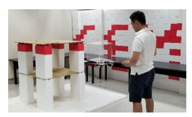
Figure 3. Prototype in-flight testing